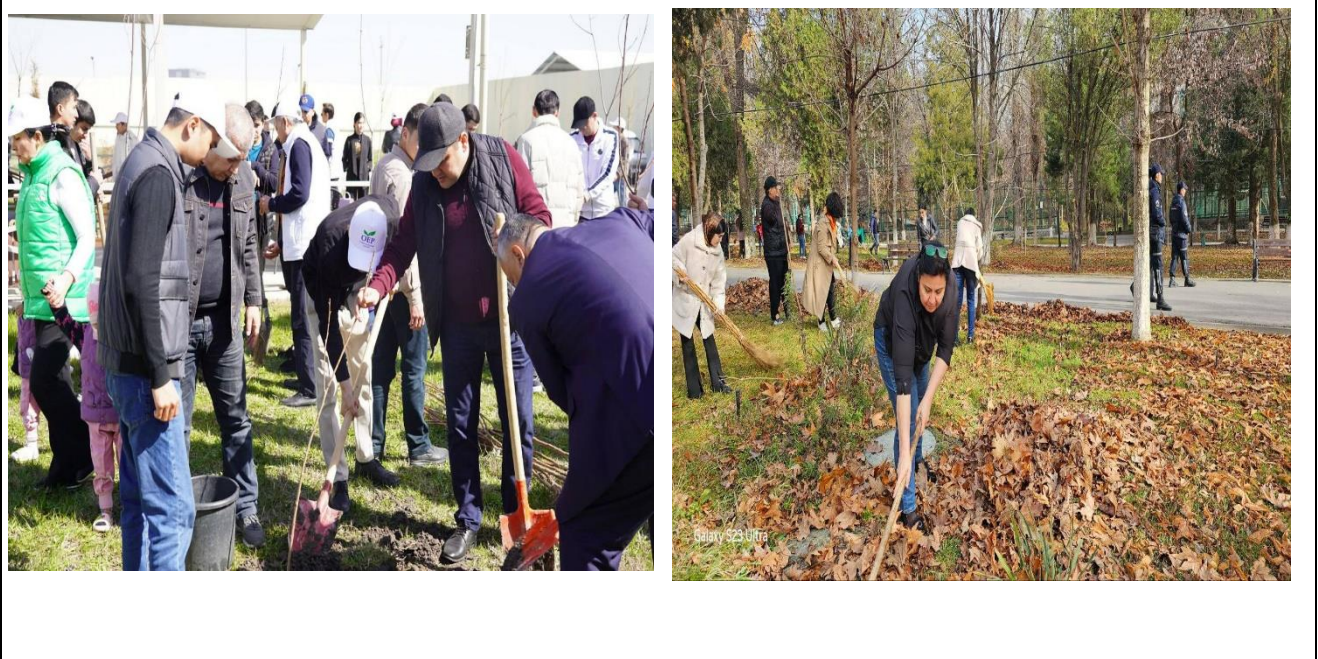
Organic Waste Treatment (UzSWLU)