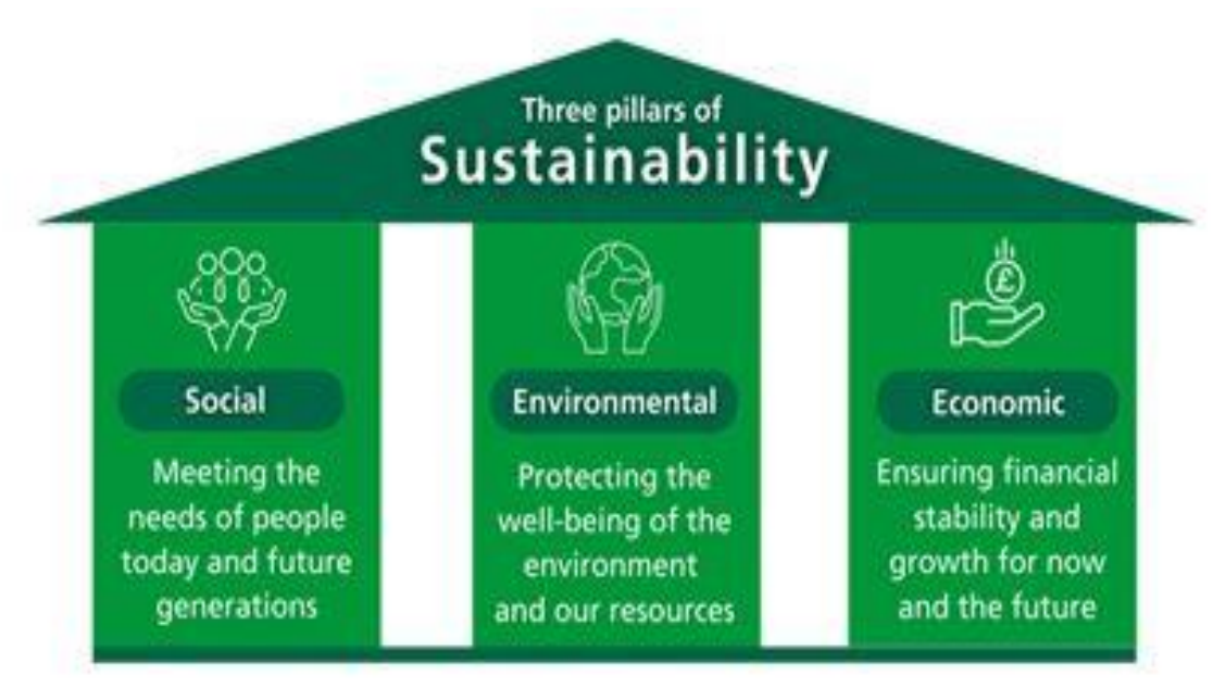
Figure- 01 Three Pillars of Sustainability

Uzbekistan State World Languages University's Sustainable Procurement Policies (Guidelines) outline the minimum sustainability requirements for product and service purchases and identify preferred, if not mandatory, product attributes. There are three pillars behind the notion of sustainability: economic, environmental, and social. This policy asserts that effective sustainable purchasing and procurement practices promote sustainable development and serve as key factors for the wise distribution and utilization of resources. As per the Brundtland Commission Report (1987), sustainable development is defined as "Development that meets the needs of the present without compromising the ability of future generations to meet their own needs."