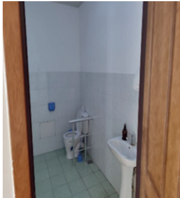
Toilets for students with disabilities