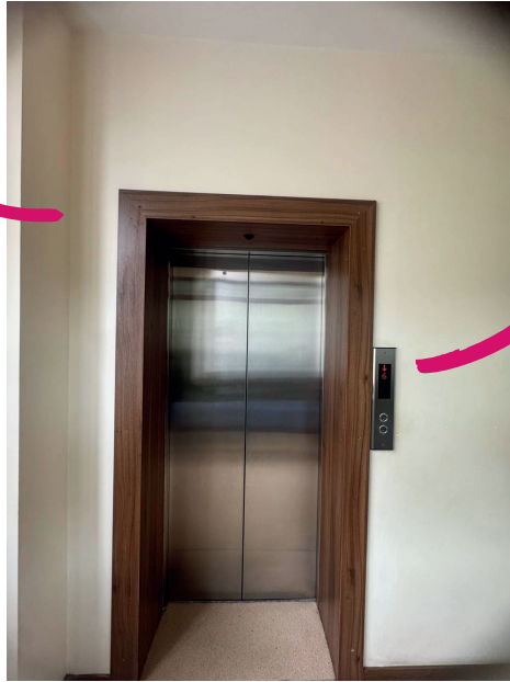
Elevator for students with disabilities